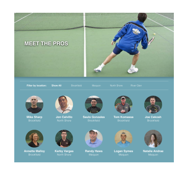
Click here to meet the rest of the Elite team!