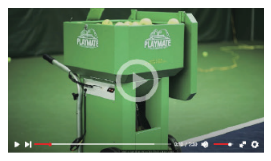
Click here to learn more about how our ball machine works!

All of our ball machines are equipped with the Playmate remote app (available in the Apple App Store). This video shows how the PLAYMATE Like My Drill App is as easy as 1-2-3. Check out the preloaded Top 5 Fitness Workouts. Each workout includes a video to see how to perform the drill.